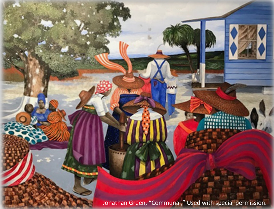
Jonathan Green, "Communal," Used with special permission.